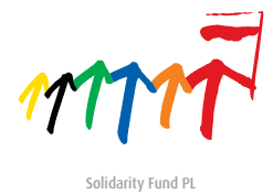
Solidarity Fund PL

A special partner in the implementation of development cooperation is the solidarity Fund PL, which is entrusted with supporting democratic processes (including local democracy) in countries undergoing systemic transformation.